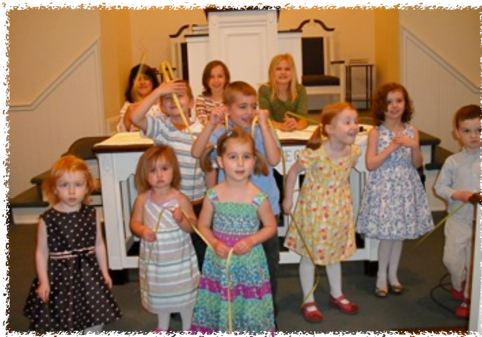
Here are some of the RPC children at the Palm Sunday practice.